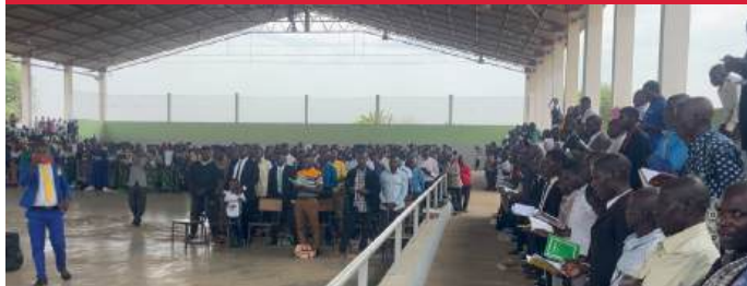
In November 2025, two souls in Guava and five souls in Maputo, Mozambique were saved and recieved forgiveness of their sins. God is so good!