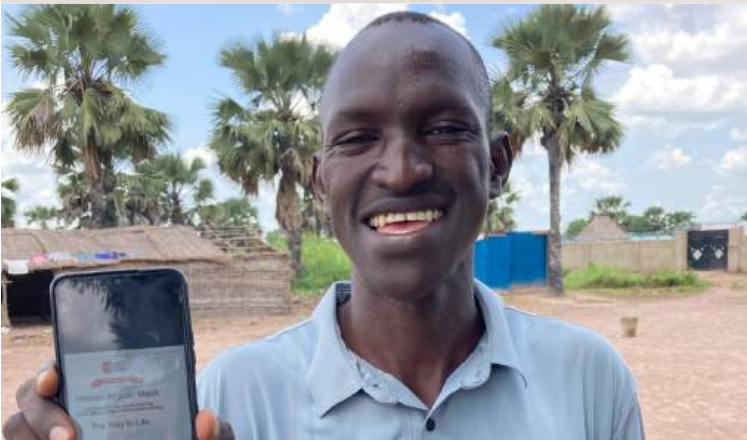
Whether by paper or digital studies with our WBS Light App, the light of the Gospel is changing lives!