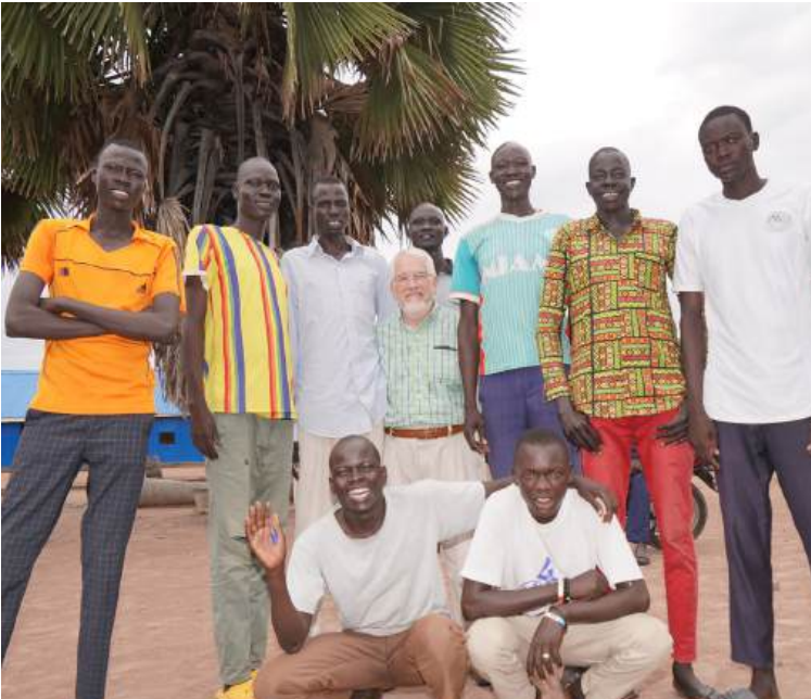
These young leaders in South Sudan want to say thank you for the WBS Study Bibles and WBS courses faithful donors sent them two years ago.

In the ACTION! Fall 2025 issue, WBS put the challenge before you to send 4,000 more WBS Study Edition Bibles to this area. The day after receiving ACTION! Magazine in the mail, a dear couple who are long-time friends of WBS called to say the check for the full $25,000 need was in the mail! By week's end, another $100,000 had been given to provide Bibles to WBS Students around the world! With these amazing end-of-the-year gifts, WBS will be able to help many Students who complete their courses have a Bible to call their own.