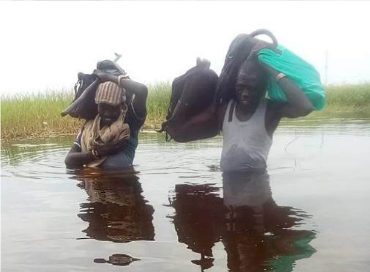
Young South Sudanese evangelists crossing swamps to share the Gospel in the next village.