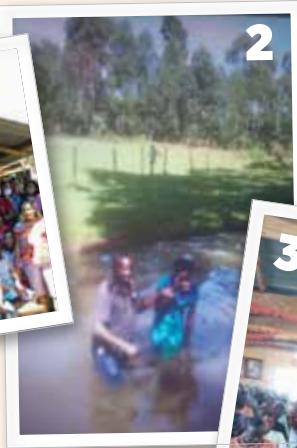
2 Mauryn reports 28 baptized by teams in Kenya.