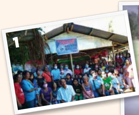
1 A new church plant, one of Bal Laguna's WBS works in the Philippines