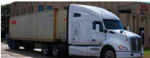
WBS NKJVs!—one of five truckloads of Bibles

30,000 NKJV Bibles – compact New King James Version with WBS study notes. Price: $6.95 .