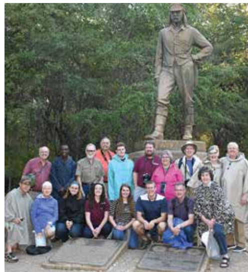
GBA campaigners at the David Livingstone statue beside Victoria Falls