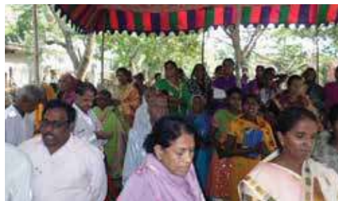
Gospel gatherings in India

Most contacts were enrolled in free Bible Correspondence courses. Soon hundreds and thousands began to obey the Gospel, resulting in numerous congregations. Over four million have enrolled in [local language] Bible Correspondence Courses. Each one who completes the course in Telugu or Oriya gets a Bible for free. From TV broadcasts ( www.satyavanicoc.com and www.youtube.com ), we now receive an average