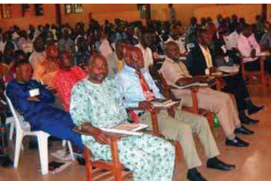
Gospel preachers at the Great Workshop

D uring this year's trip, I witnessed 66 baptized into Christ at the various villages and cities where we held World Bible School Seminars or Leadership Seminars.