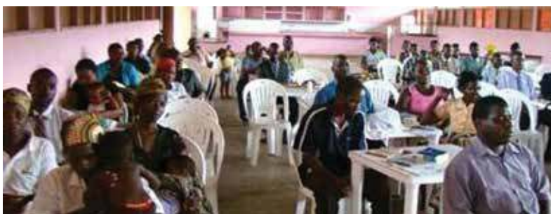
Portuguese-speaking Christians in Mozambique