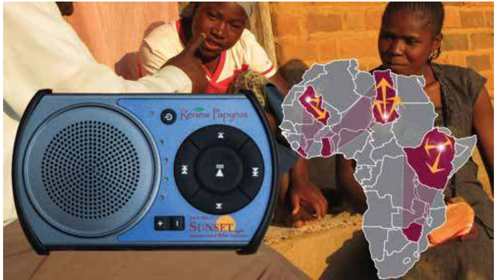
WBS lessons in audio are featured on SIBI's solar powered devices.

Next morning, you see the device sitting on a stone, soaking up sunshine that