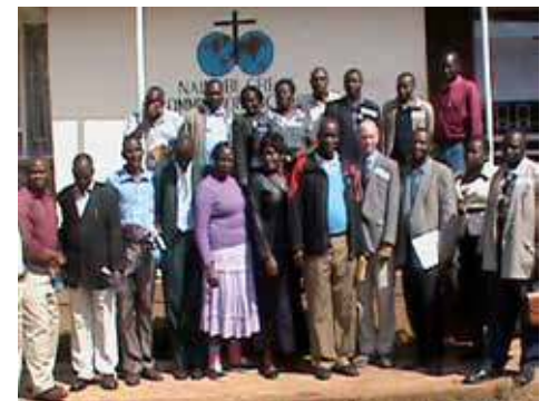
Nairobi Church of Christ

There was genuine excitement about the proposed GBEA campaign, an eagerness to participate or even lead in it. It is our prayer that Christians in every congregation in East Africa will sign up