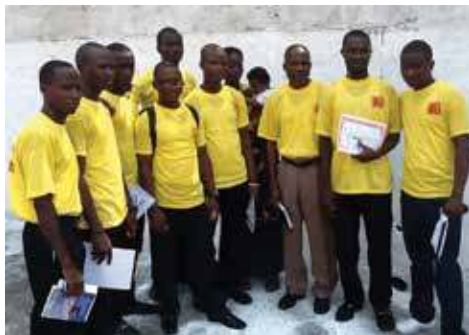
WBS graduates in Liberia