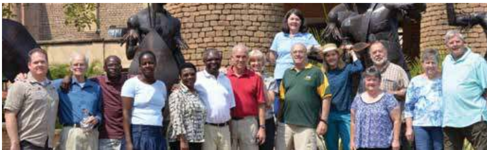
GBA campaigners and coordinators