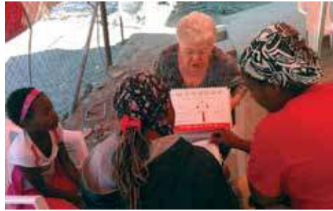
A Texas campaigner shares the Gospel.

I was privileged to be a part of the lectureship and campaign in Windhoek, planned by Fredericksburg. Christians from all over Namibia—eight congregations started by GCM—attended the lectureship. One elderly brother from the North attended. We didn't even know his