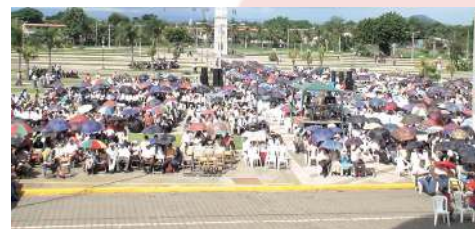
6,500 jubilant Nicaraguans took WBS "to the streets" to enroll students.

And I echo what Benny says: " ¡Dios bendirá a Nicaragua a través de la EBM! "