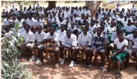
School-aged pupils in Northern Ghana are eager WBS students, too.

paign in the town and district. Campaigners pair up with local evangelists, spending five days teaching about Christ in the schools and blanketing all middle schools with about 7,000 WBS Introduction Lessons.