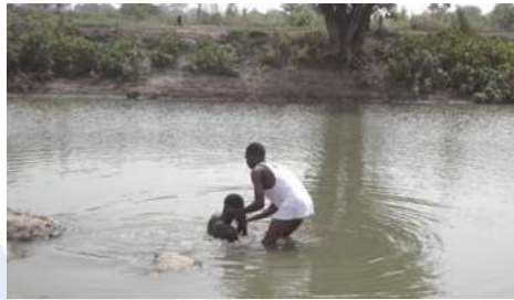
Another new believer is baptized in the Daka River.