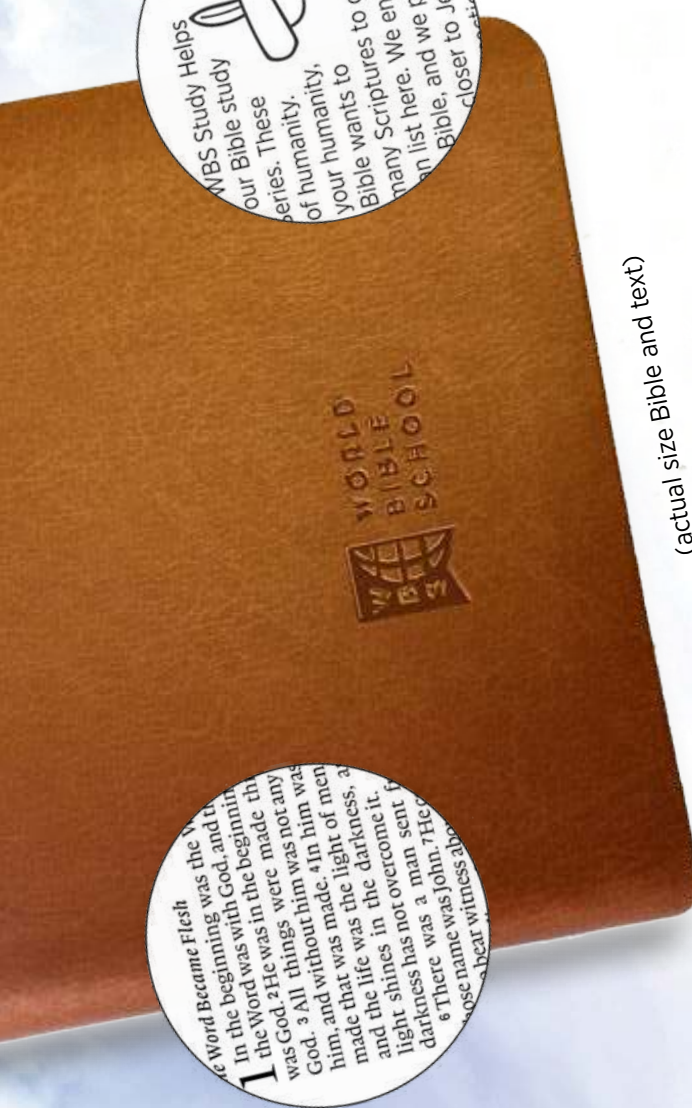
(actual size Bible and text)