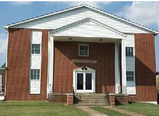
The Portland church of Christ building