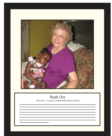
Sample Wall of Honor tribute