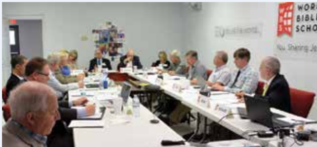
WBS leaders meet.

The Bible: World Bible School Study Edition is already a phenomenon. Since we first publicized this ESV Bible in January 2017, over 100,000 have been printed, and strong demand continues. Through the Incentive Bible program, WBS gives Bibles to proven seekers. Even with over a million current students, we plan—by faith—to fulfill the Incentive promise to as many as qualify (page 6). But why restrict the vision to horizons we can see? God leads us—He has no such limits. In recent strategy meetings, WBS leadership is exploring even greater dreams. Please be praying and dreaming with us. With God, all things are possible!