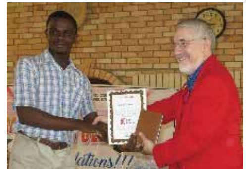
A proud graduate of PREP

Will you share Jesus with these eager students in PREP schools? Call us at 800-311-2006 for more details.